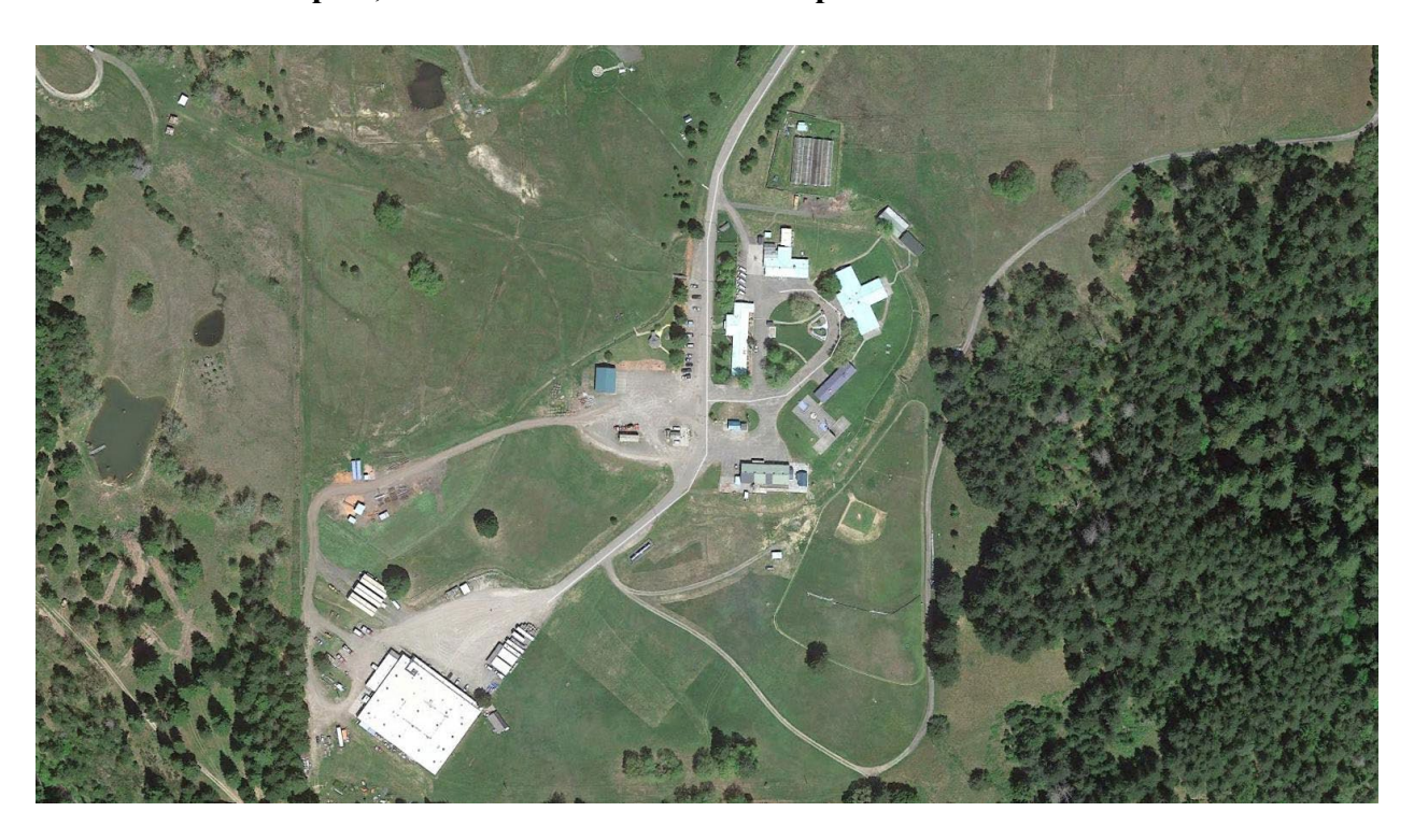
Google Image of Eel River Conservation Camp

Eel River Conservation Camp near Redway was activated February 2, 1967 as a joint operation between California Department of Corrections and Rehabilitation (CDCR), currently staffed with eleven personnel, and the California Department of Forestry and Fire Protection (CalFire), currently staffed with 14 personnel. This camp can house 132 inmates and currently houses 71 inmates.