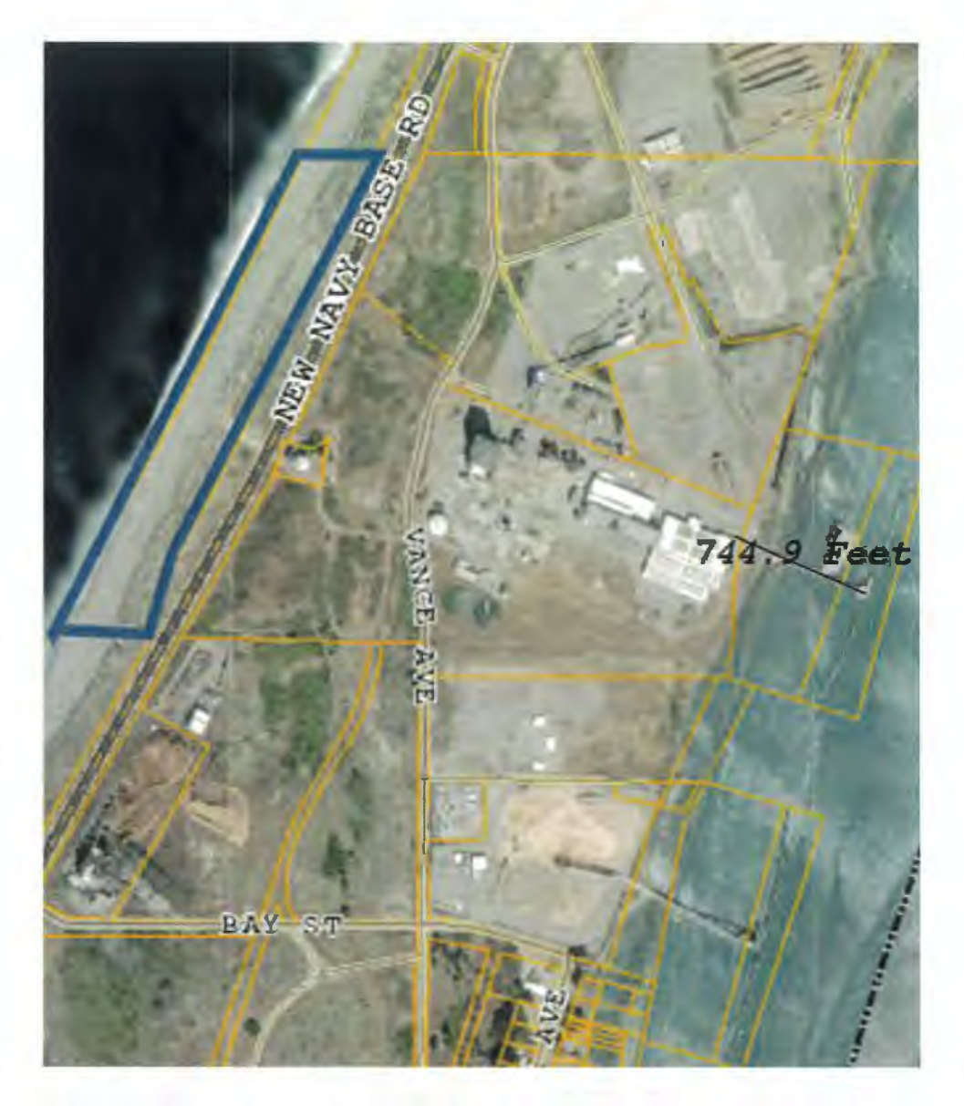
EXHIBIT A Approximate Location of the Property

Approximate location of Property shown with blue colored border.